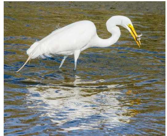
Great White Egret