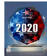
Wildlife Refuge Award

Follow us: www.wlaupstate.org and www.facebook.com/WLAUpstate